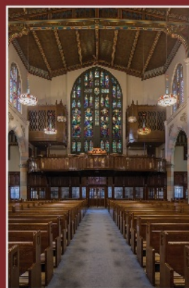
THE RUDOLPH WURLITZER COMPANY (1929)