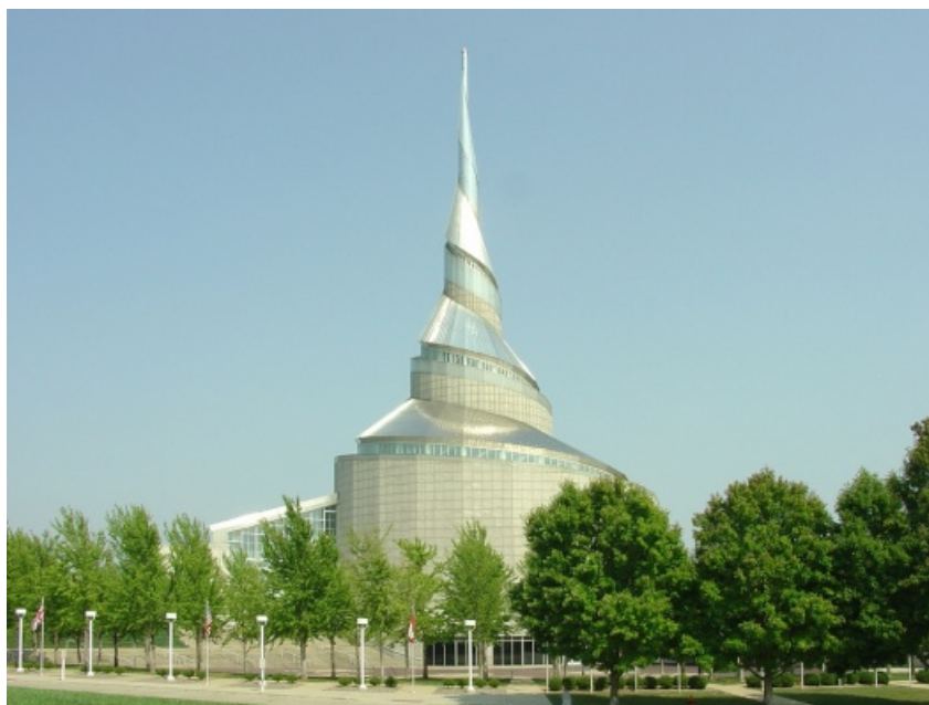
Community Of Christ Temple Independence, MO

More than 1,000 individuals are now registered to attend the 2018 AGO National Convention in Kansas City, July 2-6, but we still have room for you! The AGO National Convention offers a more comprehensive selection of educational workshops, concerts of organ and choral music, and opportunities for professional and social networking than any other single event for organists. Shop 'til you drop at the world's largest trade show for organ and choral music publishers, organ builders and manufacturers, touring and artist management companies, college and university organ degree programs, choir robes, bells and chimes! Don't miss the world's largest celebration of the organ in 2018.