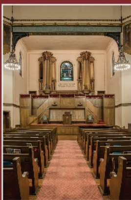
HOPE-JONES ORGAN COMPANY, OP. 2 (1908)

ORGAN HISTORICAL SOCIETY • JULY 29–AUGUST 3 || ROCHESTER • NEW YORK ||