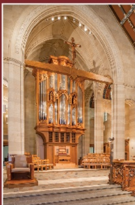
PAUL FRITTS & COMPANY, OP. 26 (2008)