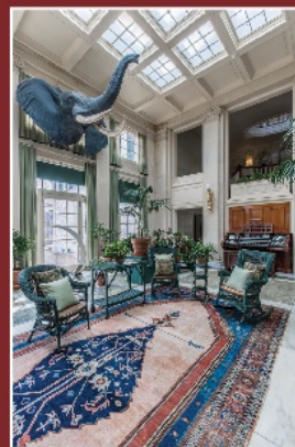
AEOLIAN COMPANY, NO. 947 AND NO. 1345