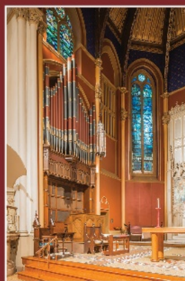
HOOK & HASTINGS COMPANY, OP. 1573 (1893)