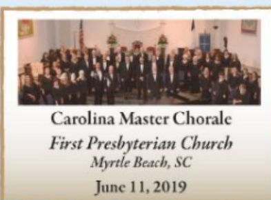
Carolina Master Chorale First Presbyterian Church Myrtle Beach, SC June 11, 2019