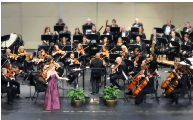
Long Bay Symphony