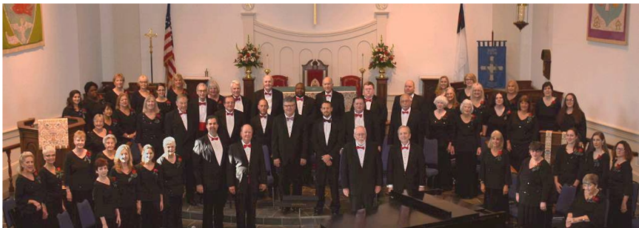
Carolina Master Chorale