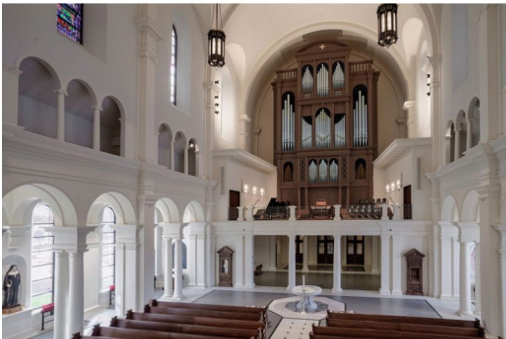
C. B. Fisk Op. 147 Photo by

All concerts begin at 7:30 pm unless otherwise noted.