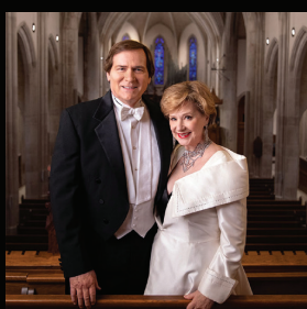
The Chenault Organ Duo