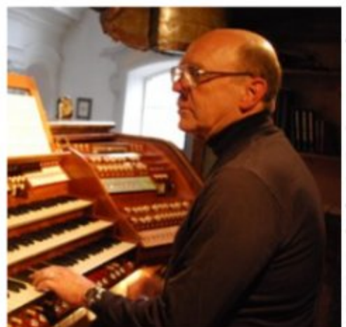
OCTOBER 10 TUESDAY I 7:00 PM