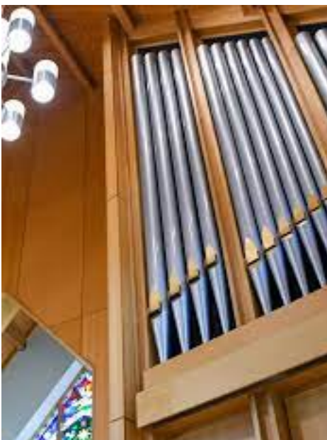
Organ in Butler Chapel, Campbell University

Most of all, please help us think of engaging topics that will help us all share our knowledge and our love of playing!