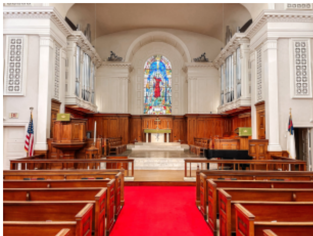
Providence United Methodist Church